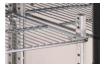
Chrome adjustable shelves